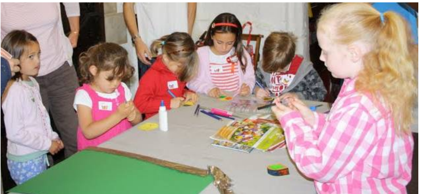
Yellow Team working on their team display